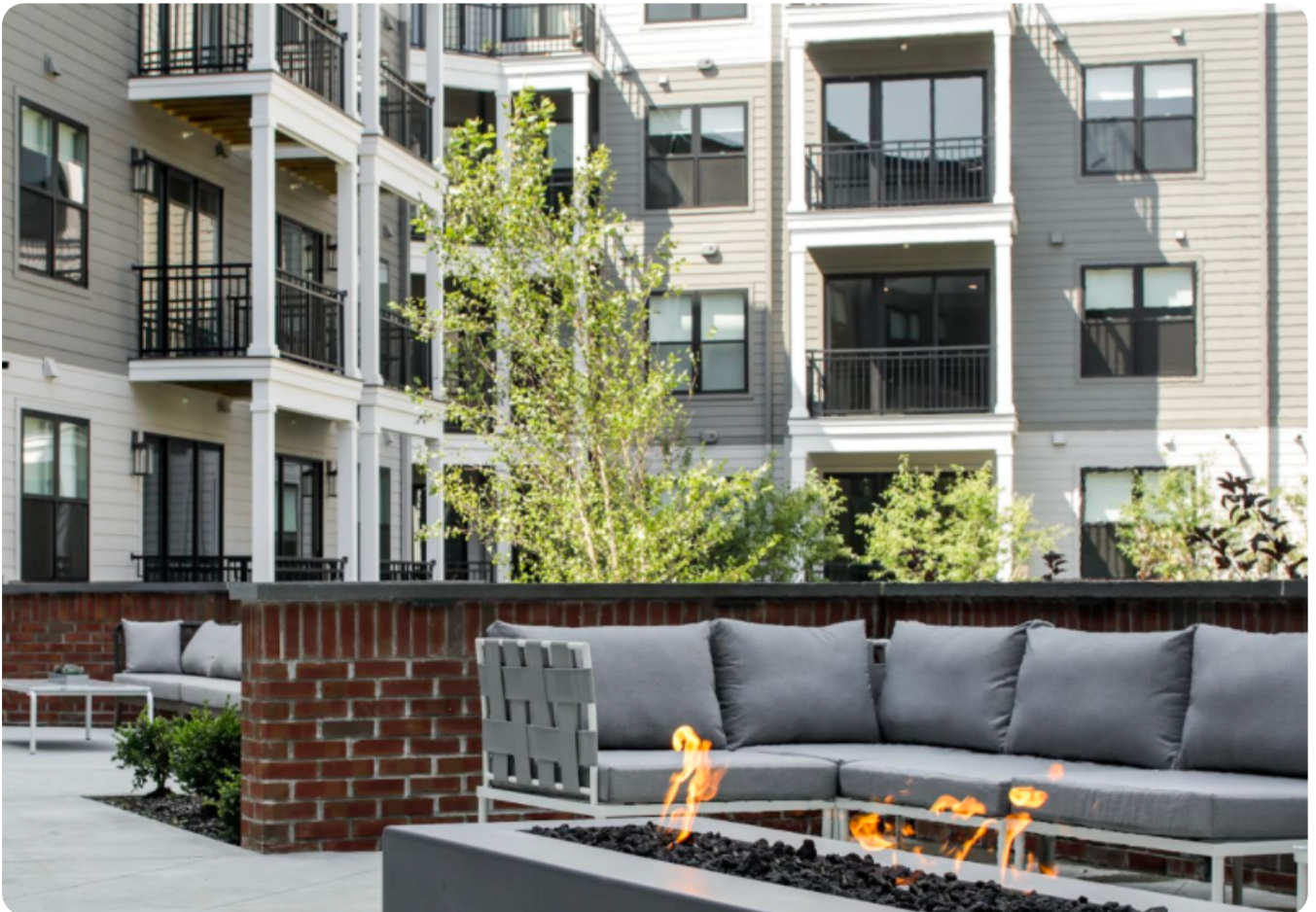
Clarus Glen Ridge.